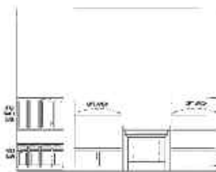
ELEV. @ GREAT ROOM FIREPLACE / DRYWALL SHELVES