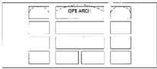
OPT. MEDIA SHELVING 48" OPT. MEDIA ROOM