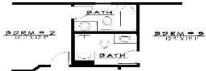
OPT. SEPERATE BATHS