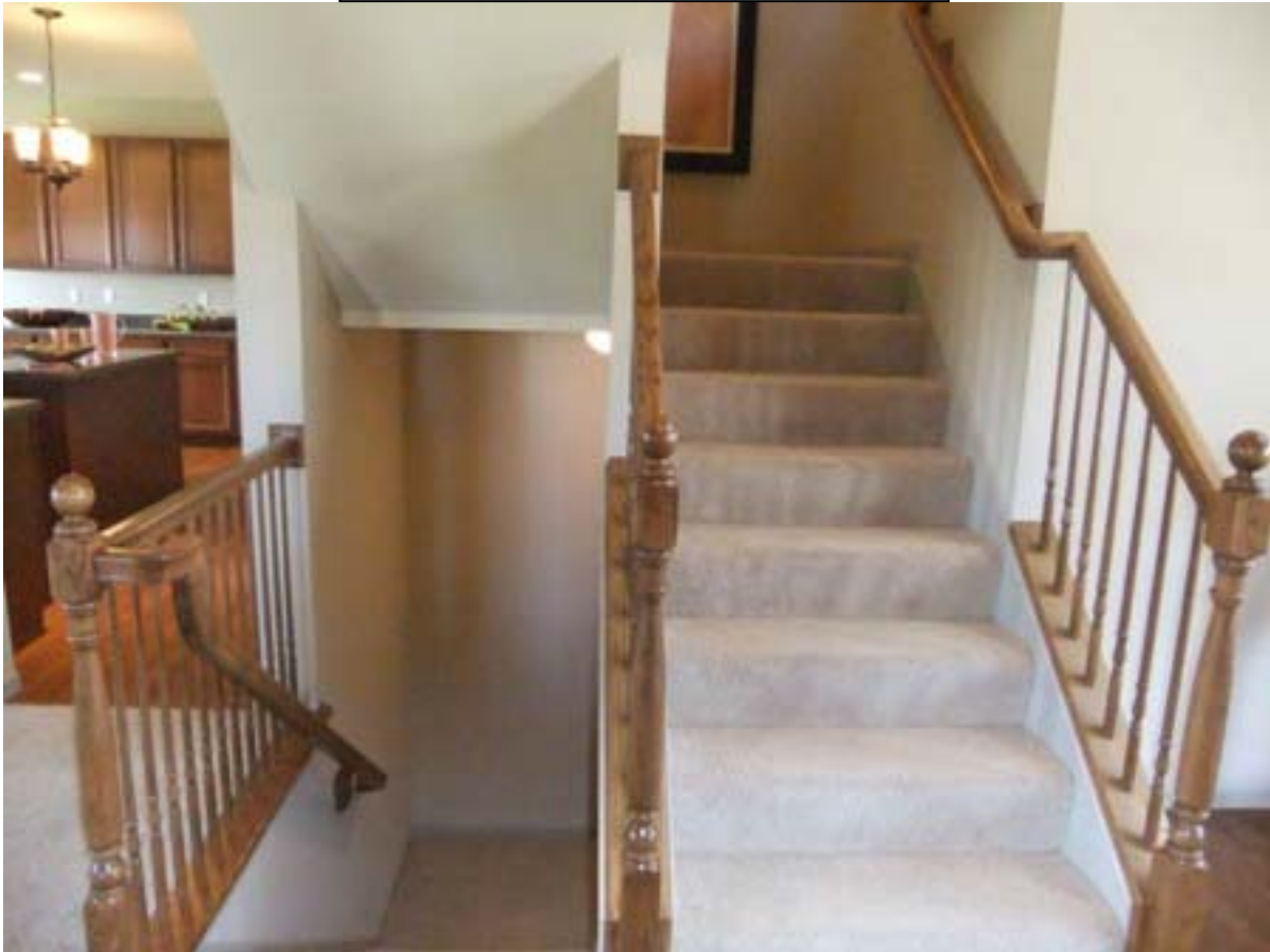
1 ST FLOOR STAIRS