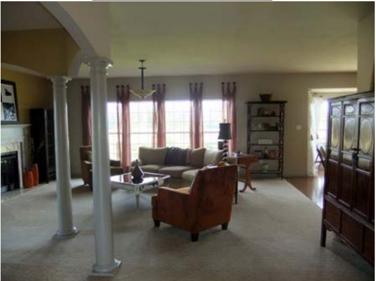
DINING ROOM / GREAT ROOM