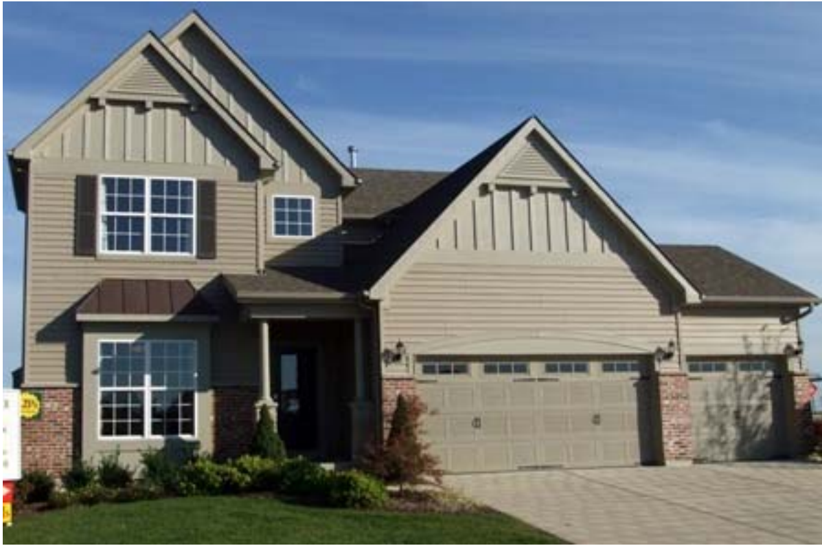
FRONT ELEVATION #4 REVISED