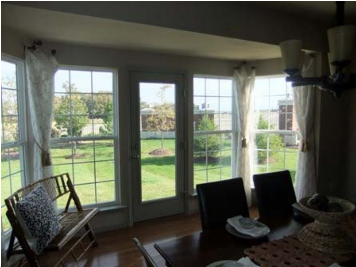
BREAKFAST ROOM BAY