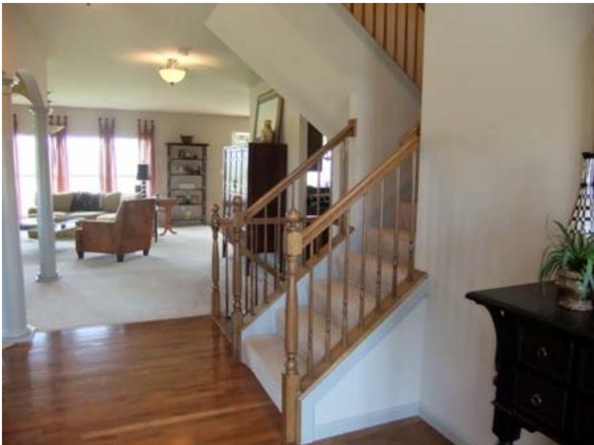
1 ST FLOOR STAIRS - FOYER