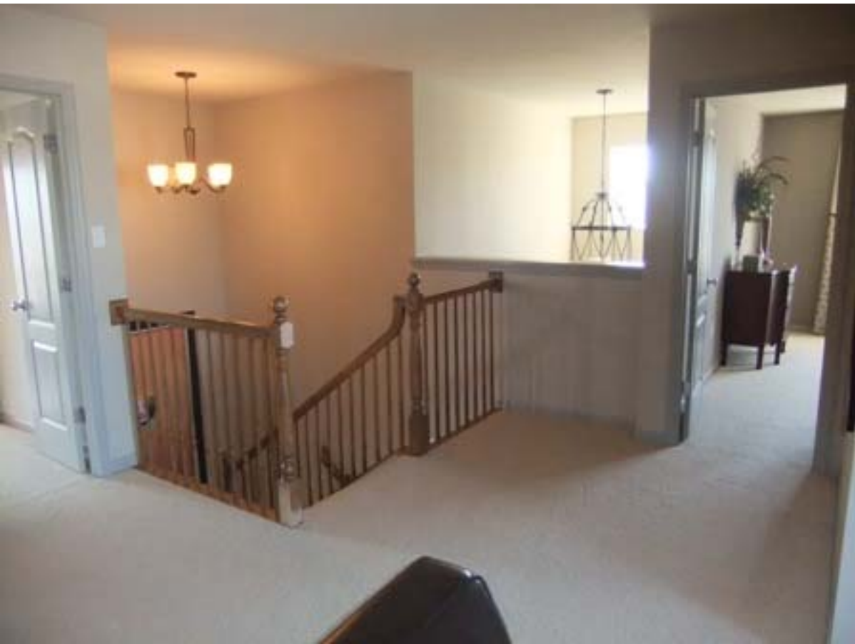
2 ND FLOOR STAIRS