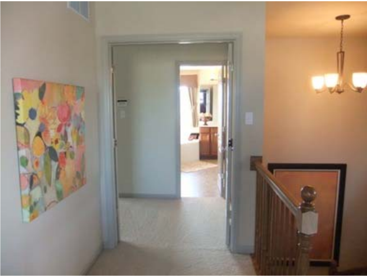
2 ND FLOOR HALL AT MASTER BEDROOM